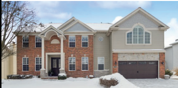
2332 Wild Timothy Road Sold $820,000 (over list price)