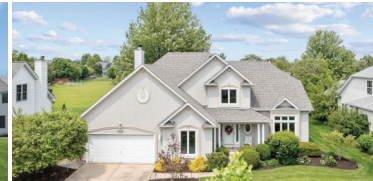
2635 High Meadow Road Sold $675,000 (over list price)