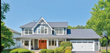
5207 Salt Meadow Road Sold $715,000 (over list price)

If you're curious about your home's value, call Doreen Booth, Your High Meadow Expert! With 7 closed sales in 2024 to date and 1 home under contract, Doreen knows the High Meadow Market!