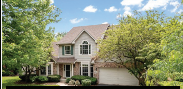
2304 Snapdragon Road Sold $640,000