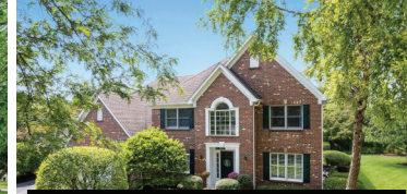
5327 Catclaw Court Sold $764,000 (over list price)