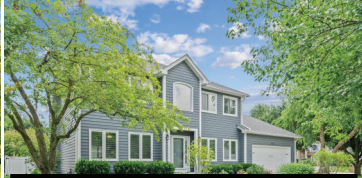
5336 Wirestem Court Sold $705,000 (over list price)