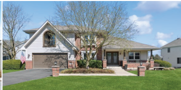
5216 Thatcher Drive Sold $735,000 (over list price)